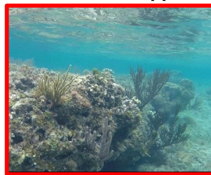
Snorkeling around patch reef.