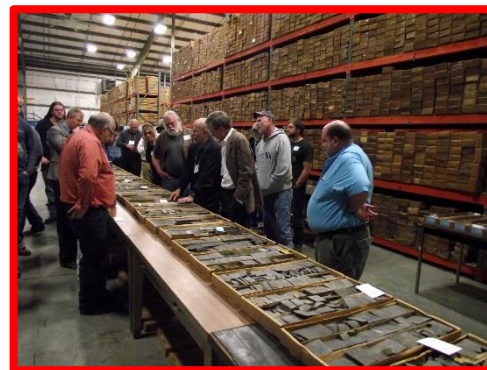
Hands-on core presentation.