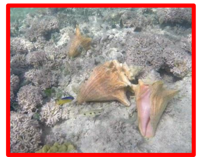
Plenty of snorkeling opportunities.