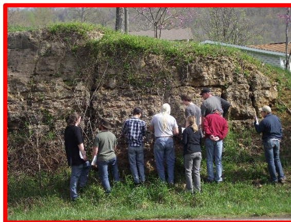
Examination in the field.