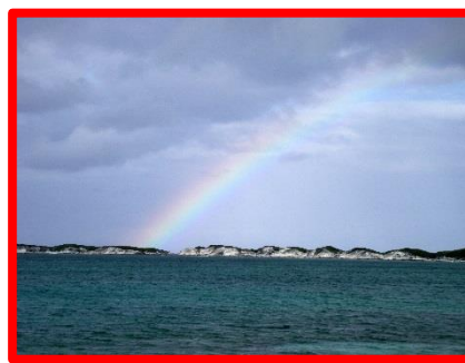
Rainbow over Holocene eolian sand dunes.